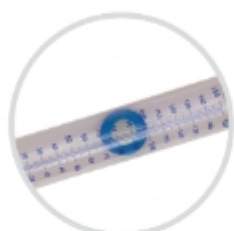
Automatic shut off floating valve