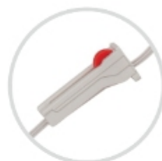
Smooth Flow Controller