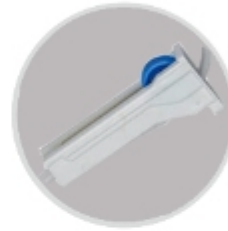
Smooth Flow Controller